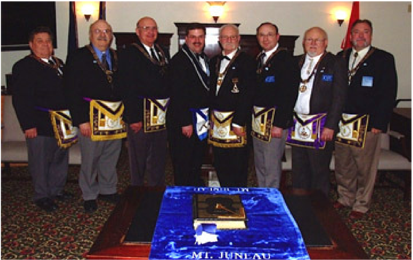
Annual Visitation by the Grand Master and Grand Line Officers, April 5, 2011.